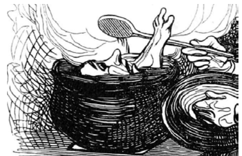
Honoré Damier, Stew , 1840