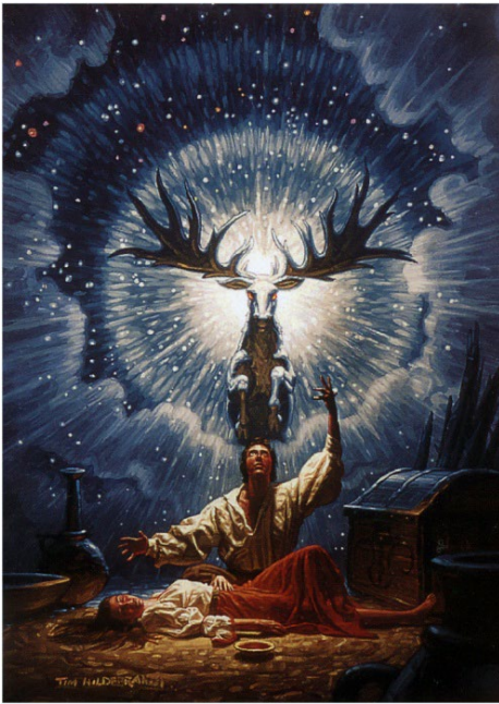
Cover Art for Gifts of Blood by Tim Hildebrandt