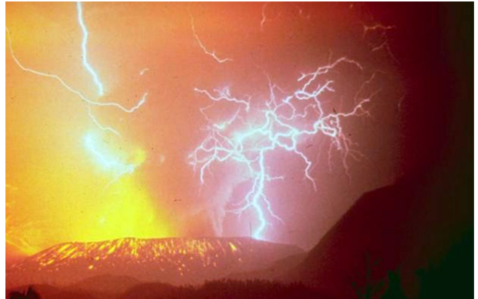
Volcano Galangung

down to the dirt. I lie there paralyzed while the old woman trickles a ragged line of salt in a circle around me.